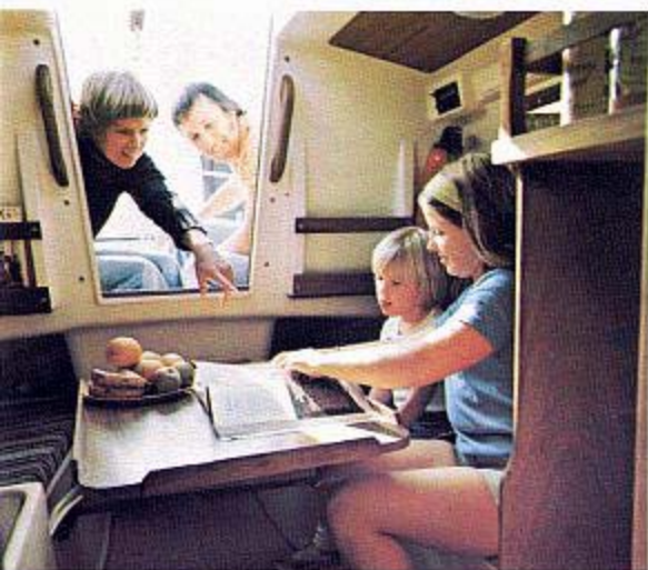
Rigged and ready to launch