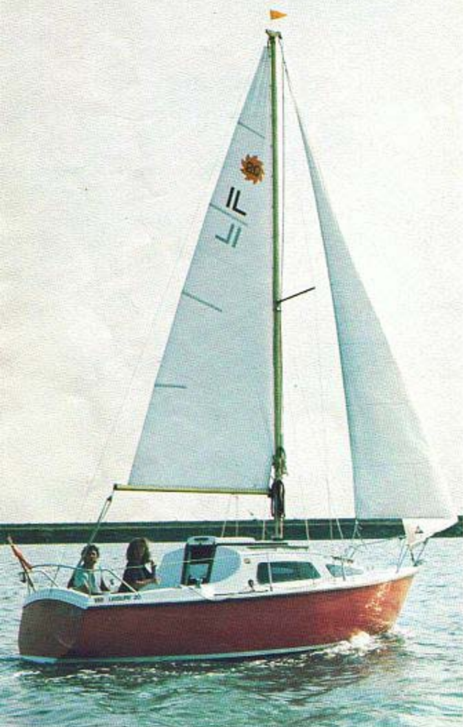
Running Goose Winged

The standard specification is very comprehensive and includes stainless steel pulpit, stemhead, main marine genoa track, R.W.O. mainsheet track, Barlow winches, Marlow terylene running rigging, stainless steel standing rigging, stainless steel bottle screws, gold anodised mast